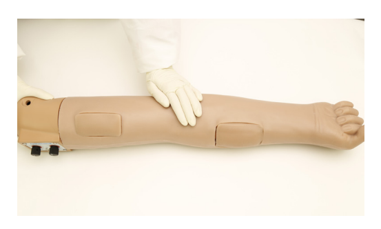
16. Proceed to the "Priming the System" section as replacing the vein will introduce air into the system and it will need to be re-primed.