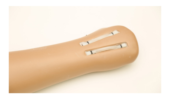
14. Use new tape to hold the veins in position as there were originally.