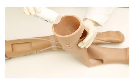
14. Place the new skin over the hand and pull it all the way up.