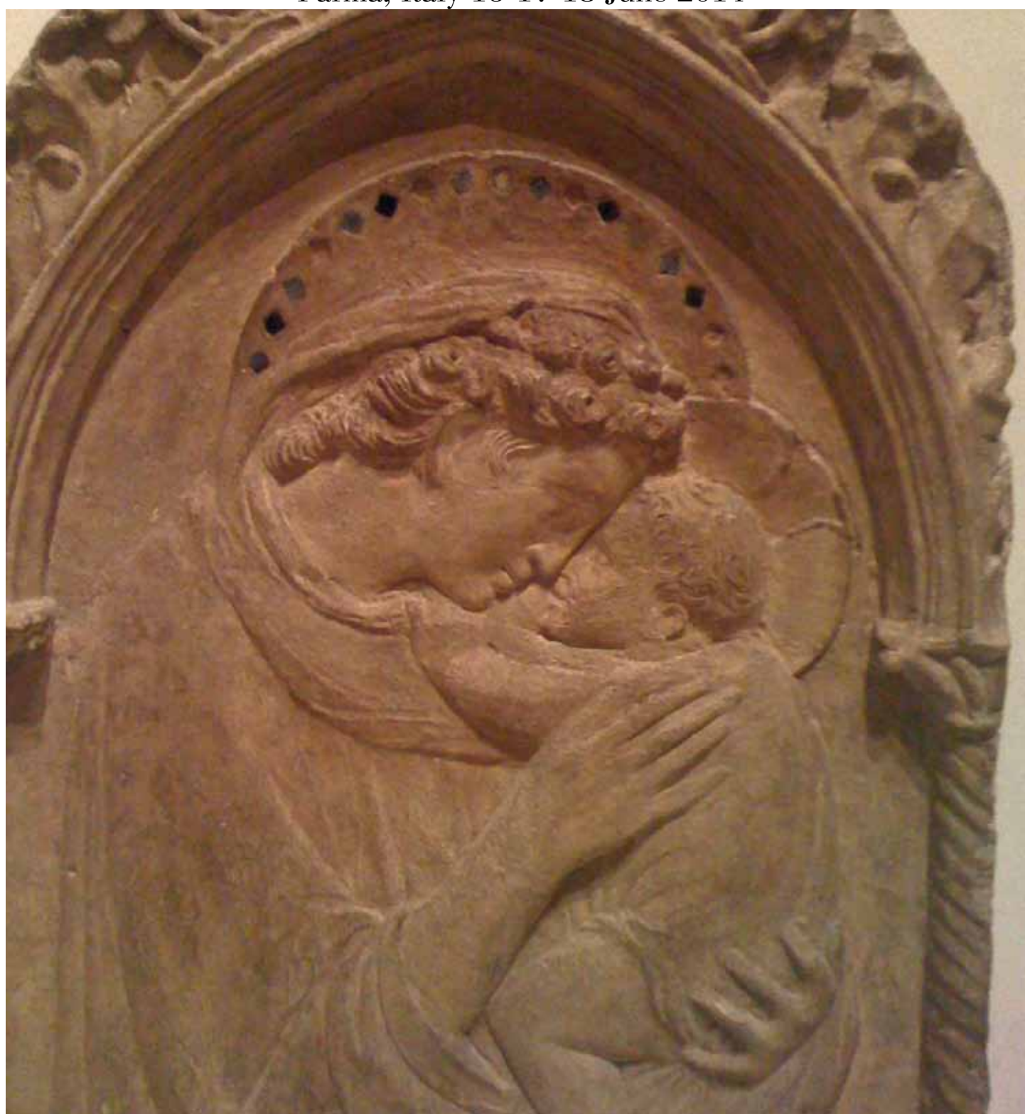
Madonna e Bambino, (ca. 1420, marble 74.5 x 73 x 6.5), known as the Pazzi Madonna, Donatello (circa 1386-1466), Bode-Museum, Berlin