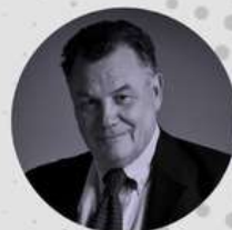
PROF. FRANCESCO CASETTI YALE UNIVERSITY, USA

Screen-based media create a recurring pattern for the settings in which they operate. As we can see in an early instantiation like the Phantasmagoria, the screen is matched by a physical enclosure in which the audience gathers. As the enclosure severs the audience from the external reality, the screen provides an opening towards the reality spectators left outside, as well as towards otherwise inaccessible worlds. While apparently decoupling media and space, recent screen-based media like laptops, tablets, and smartphones create a sort of individual bubble that includes the peri-personal space of their users. Users find a shelter in this bubble even when they are in public. The lecture will trace a potential lineage from the physical enclosure of the early screen based dispositives to the bubble elicited by electronic media, and will argue that both of these optical-spatial arrangements are part of what we can call the projection/protection complex, i.e. the convergence of sensorial deprivation and safe access to new worlds. By uncovering the connections with other “complexes” like the “exhibitionary complex” analyzed by Bennett, this archeology will ultimately bear witness of the variety and trends of media environments.